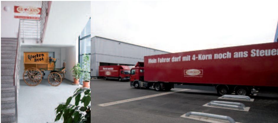
Glocken Bakery was taken over by the REWE Group in 1986.

As of February 2010, bakery products are produced in Bergkirchen for 1,100 REWE, TOOM and PENNY outlets.