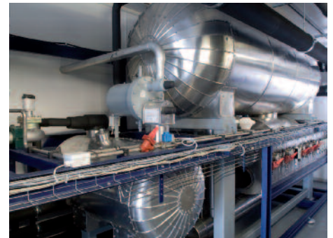
\text{NH}_3/\text{CO}_2 machine assembly within the container

"Our concept has consistently proven itself," says Jan Schulte. "The system runs without problems and the components are also of the right quality."