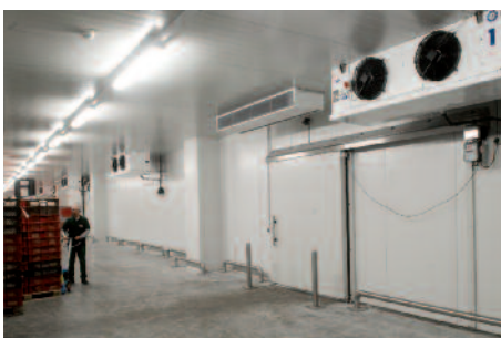
GGHN drycoolers in cold storage rooms