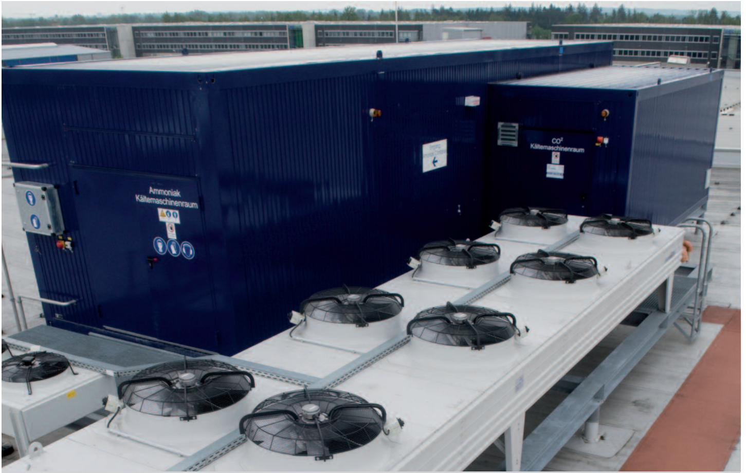
AGVH NH3 condenser; to its left: GFH drycoolers